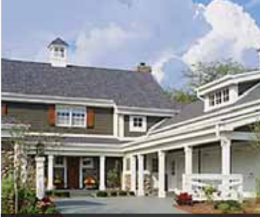
Hamilton Proper, 2001